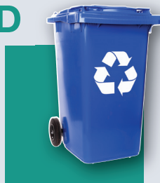
City of Shelbyville Recycling Program

A ✓ denotes that the program accepts the item for recycling.